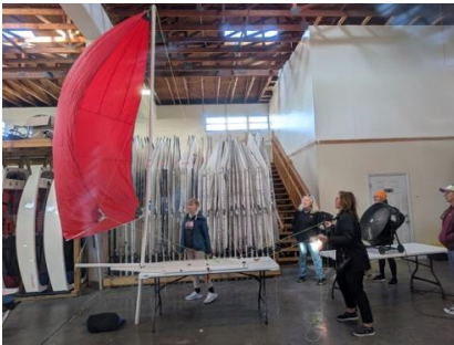
Spinnaker practice with the Madigan simulator