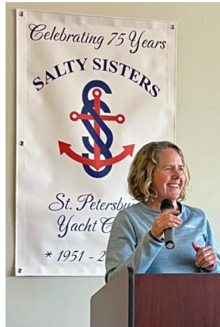
PC Dee updating us on the status of our Sunfish fleet