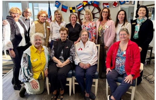
Salty Sisters at the FWSA General Meeting Jan 21