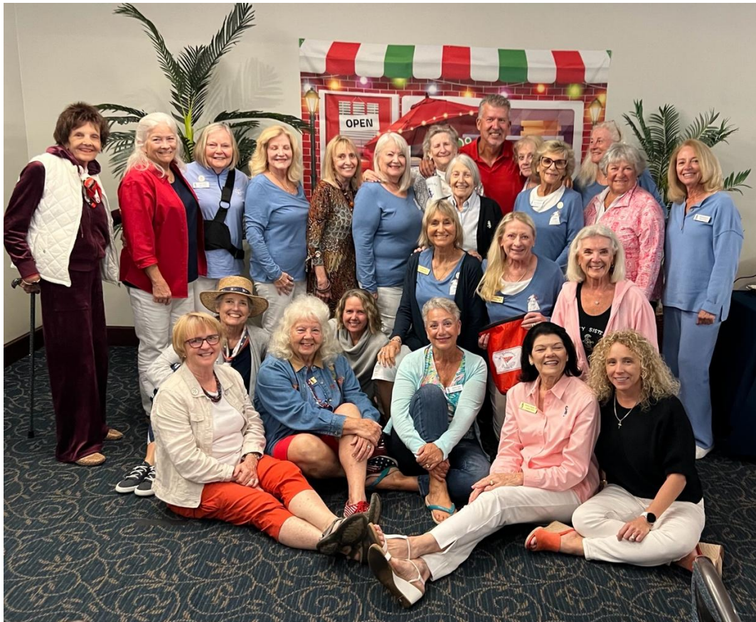
Salty Sisters celebrating our 75 th Anniversary at the Trivia and Pizza Party.