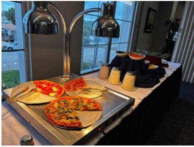
A variety of pizzas!